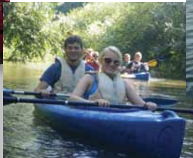
Right: Kayaking was enjoyed by all.