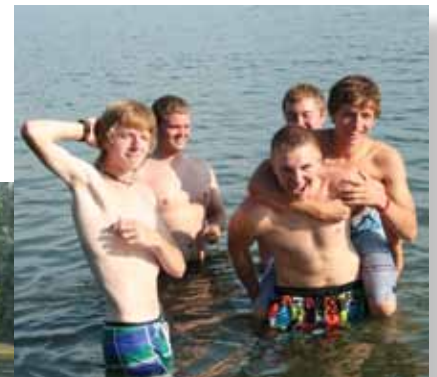
Above: Enjoying the water at the Farewell Party — boys will be boys whether in the U.S. or Germany.